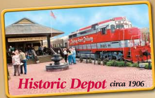
Historic Depot circa 1906

Over a century-old, the Branson Depot has been a destination of travel for generations. Its design is classic Americana. Visit the gift shop inside for unique gifts featuring railroad memorabilia of all kinds, and a line of Thomas the Tank Engine™ products.